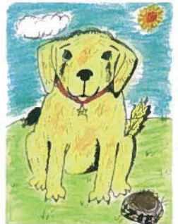
Zoe, Age 7

Examples: Dogs, Cats, Birds, Bunnies, Horses, Lizards and more! In this class students will learn how to draw a variety of pets using the Monart drawing method. Our non-competitive environment will encourage young artists of all skill levels and promote success! Students will work with various mediums such as watercolor, oil pastels, colored pencils and more. Each week a fact sheet will accompany a completed drawing.